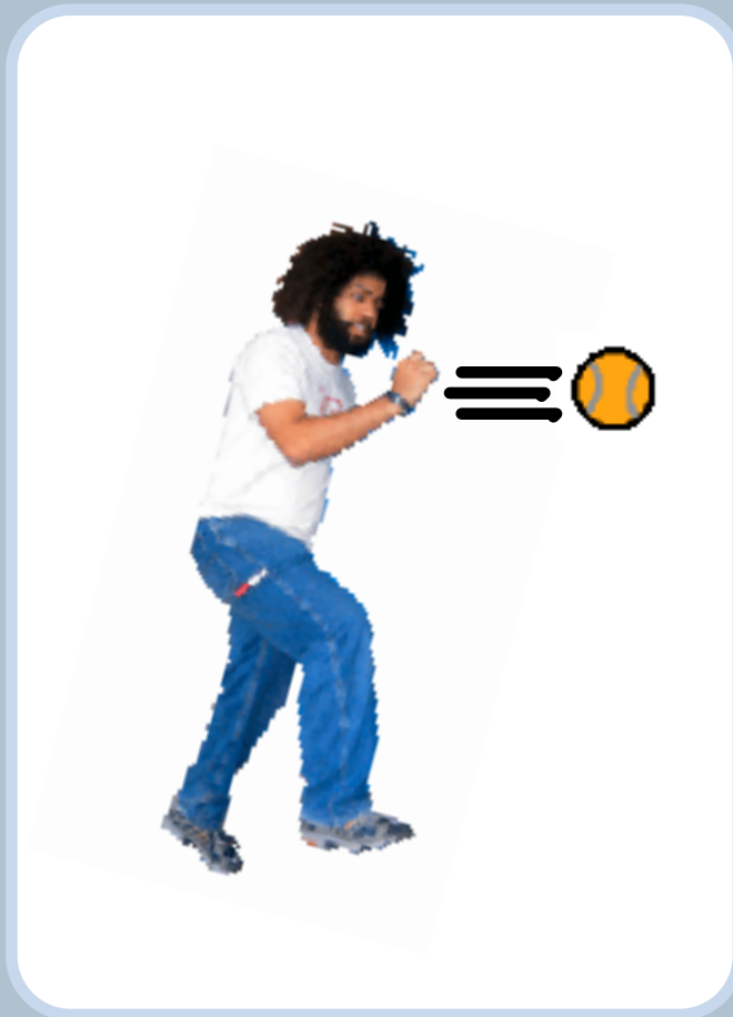
Scratch Activity cards from Stratolab www.stratolab.com